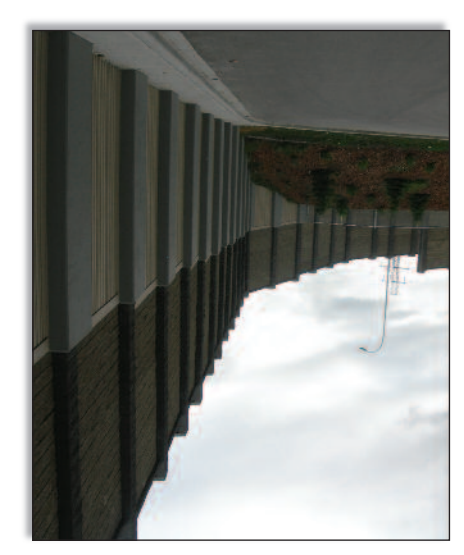
Allan Block Technical Newsletter -4th Qtr 2012

© 2012 Allan Block Corporation, Bloomington, MN Phone 952-835-5309, Fax 952-835-0013, DOC. #R0922-1012