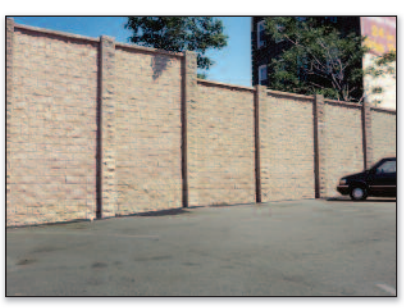
Sound Barrier -McDonald's Restaurant, NJ

Have an smart phone or tablet? Download our App and eBook Installation Manuals.